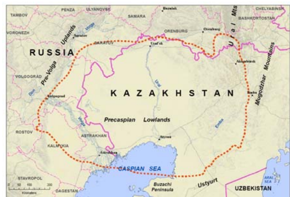
General Location Map of the Precaspian Basin

Part I of Volume I of the report begins with a short overview of the geography , geology and exploration history of the area. The remainder of Part I comprises a systematic description of the geological development of the area, beginning with its tectonic development in the context of the basin's position on the southeastern "corner" of the East European Platform.