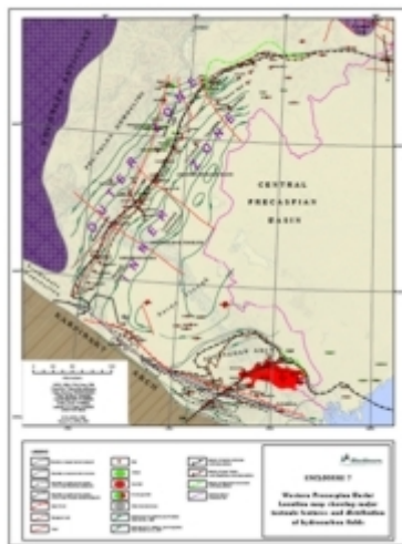
Western Precaspian Basin

The report includes stratigraphic correlations, regional cross sections and other large-format enclosures. All maps are georeferenced and are available in ArcGIS format .