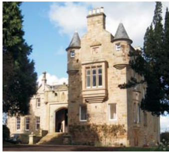
Carriden House Carriden, West Lothian, EH51 9SN Telephone: 01506 826777