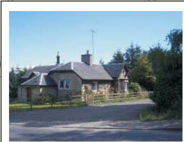
Unmarked turning onto unsurfaced farm track beside stone cottage

From Bo'ness town centre to Carriden House: Travel along the A904 towards Edinburgh. After approximately 1 ½ miles the road turns sharply right uphill onto Carriden Brae. After 500 yards, towards the top of the hill, there is a sign for Muirhouses. 100 yards after this sign there is an unsurfaced farm track beside a stone cottage (see above photo). Turn left into this track and follow for 700 yards. Carriden House is the 4th property on the left. From Linlithgow town centre to Carriden House: From Linlithgow, take the A803 towards Bo'ness. Continue on to the A904. Turn right opposite a bus shelter into Carriden Brae (signposted for Bo'ness & Kinneil Railway Clay Mine). The third turning on the right is an unsurfaced farm track beside a stone cottage (see above photo). Turn right into this track and follow for 700 yards. Carriden House is the 4th property on the left.