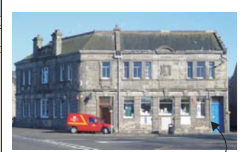
26 East Pier Street, Bo'ness (Blue door next to Post Office) Tel: 01506 828110